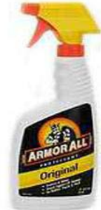
Item # M64202 U/M - Each