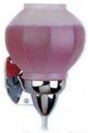
Item # M60732 U/M - Each