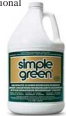
Item # M65085 U/M - Each