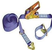
Item # M14806 U/M - Each