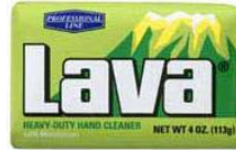
Item # M66210 U/M - Each