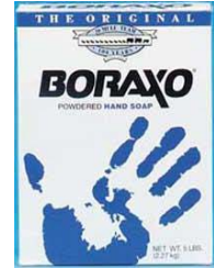
Item # M66222 U/M - Each