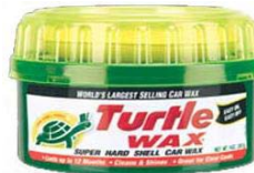
Item # M64251 U/M - Each