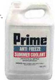
Item # M64056 U/M - Each