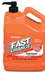
Item # M65703 U/M - Each