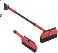
Item # M64077 U/M - Each