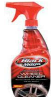
Item # M64207 U/M - Each