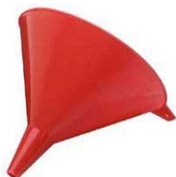
Item # M12076 U/M - Each