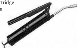
Item # M65870 U/M - Each