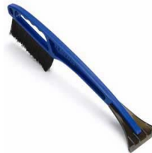
Item # M64076 U/M - Each