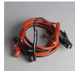
Item # M64074 U/M - Each