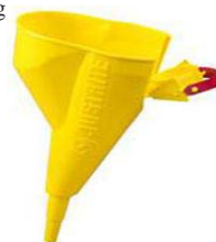
Item # M12079 U/M - Each