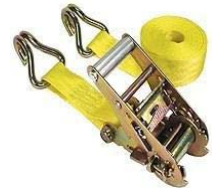
Item # M14811 U/M - Each