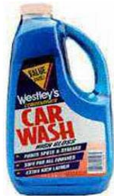
Item # M64070 U/M - Each