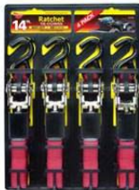
Item # M14803 U/M - Pack