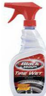
Item # M64205 U/M - Each