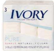
Item # M66205 U/M - Each