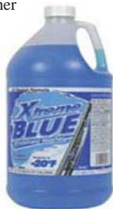
Item # M64064 U/M - Each