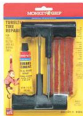
Item # M64101 U/M - Each