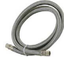
Item # M99776 U/M-Each