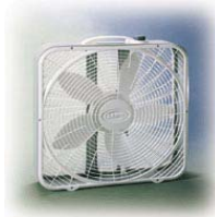
Item # M70239 U/M - Each