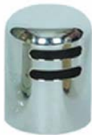
Item # M91266 U/M - Each