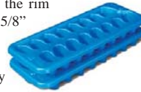
Item # M76501 U/M - Each