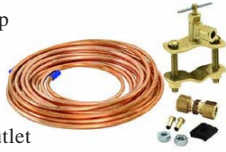
Item # M99772 U/M-Each