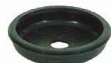
Item # M91089 U/M - Each