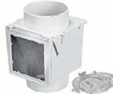
Item # M70124 U/M - Each