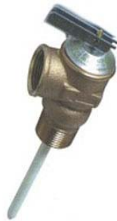
Item # M99756 U/M - Each