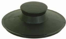
Item # M91092 U/M - Each