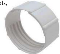
Item # M70109 U/M - Each