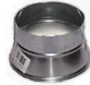
Item # M70832 U/M - Each