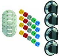
Item # M71210 U/M - Pack