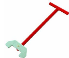
Item # M99011 U/M - Each