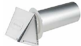
Item # M70017 U/M - Each