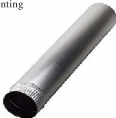
Item # M70010 U/M - Each