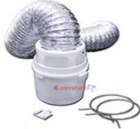
Item # M70122 U/M - Each