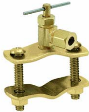
Item # M99764 U/M - Each