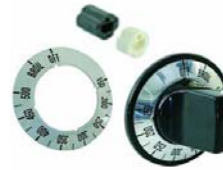
Item # M71207 U/M - Each