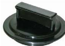
Item # M91203 U/M - Each