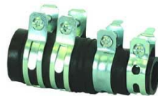
Item # M91279 U/M - Each