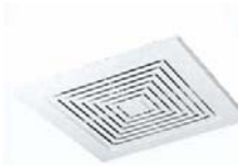
Item # M84919 U/M - Each