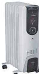
Item # M70243 U/M - Each