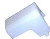
Item # M70889 U/M - Each