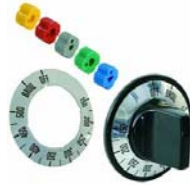
Item # M71204 U/M - Each