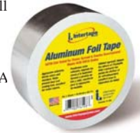
Item # M10060 U/M - Each