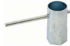
Item # M99006 U/M - Each