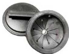
Item # M91091 U/M - Each