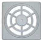
Item # M70922 U/M - Each