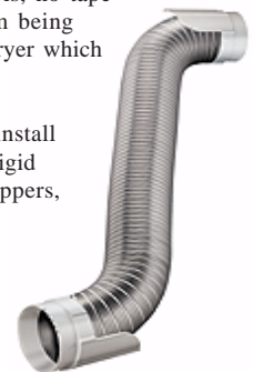
Item # M70005 U/M - Each