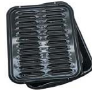
Item # M71255 U/M - Each