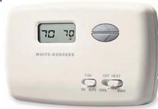
Item # M70233 U/M - Each