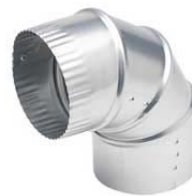
Item # M70014 U/M - Each