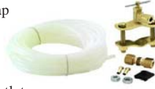
Item # M99768 U/M-Each