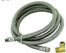
Item # M99328 U/M - Each