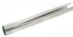
Item # M70841 U/M - Each