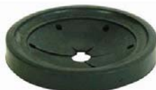
Item # M97524 U/M - Each