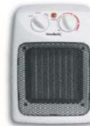
Item # M70241 U/M - Each