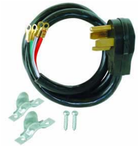
Item # M80065 U/M - Each