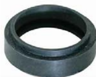
Item # M91278 U/M - Each