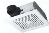
Item # M84915 U/M - Each