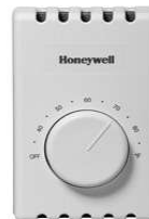
Item # M70235 U/M - Each