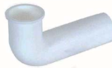
Item # M93694 U/M - Each