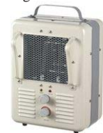
Item # M70245 U/M - Each