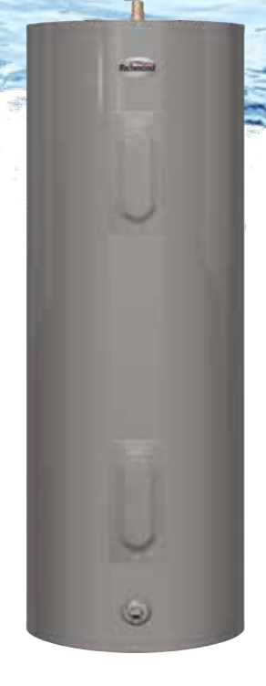
Essential 28, 30, 36, 38, 40, 47 and 50-Gallon Capacities 240 Volt AC/Single Phase Electric