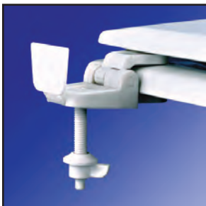
Corrosion proof, self-aligning hardware