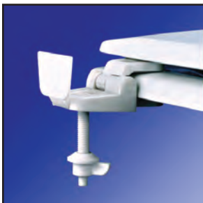
Corrosion proof, self-aligning hardware