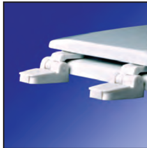
Factory-installed "living" hinge covers w/stainless steel screws